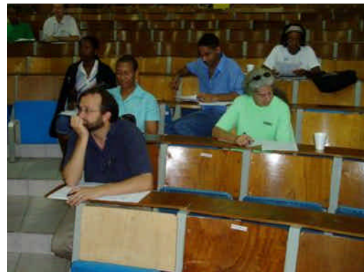
(Above ) A captive audience