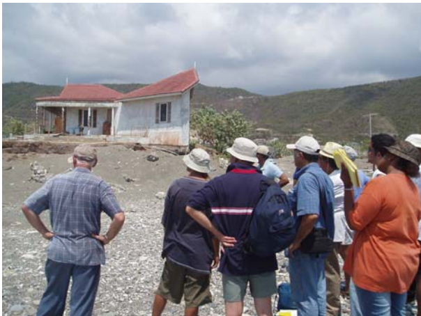
Above: Group observing the damage caused by hurricane Ivan at Copacabana