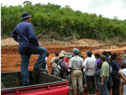
The president surveys the troops

http://gsj.monainformatixltd.com/latest.html