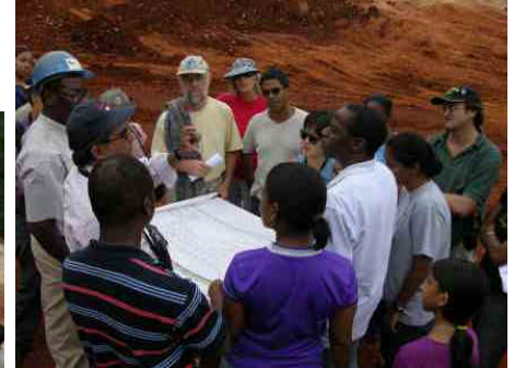
Rafi questioning Locksley